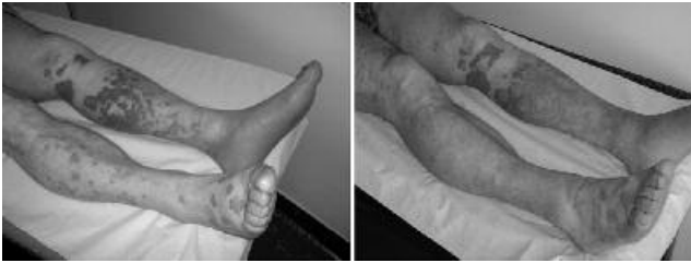
Figure 1 - Cutaneous pattern of the leg before (left) and after (right) gemcitabine treatment.